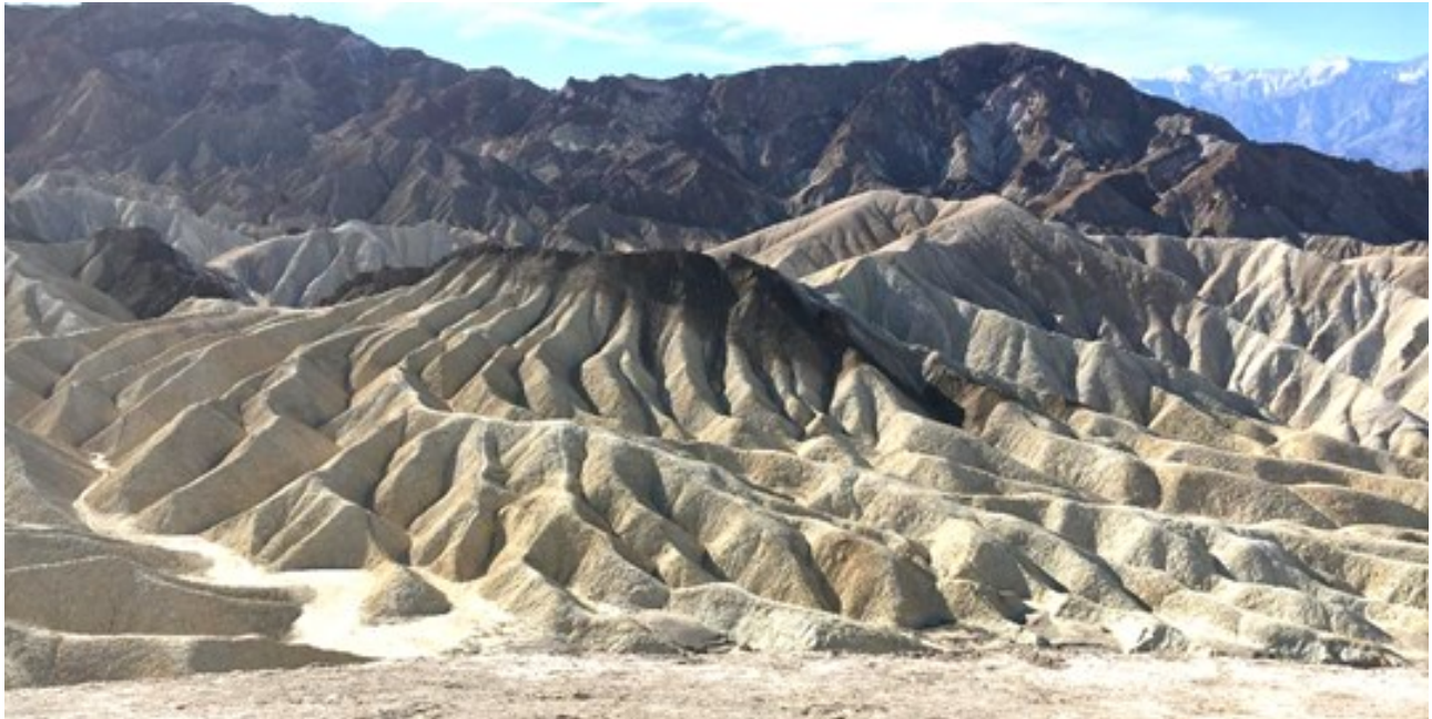
Erosional landscape around Zabriskie Point on the California side of Death Valley National Park.