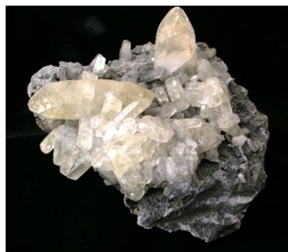
Specimen's upper section by daylight.

The upper section of this specimen consists of several truncated rhombohedron calcite crystals ranging from 3 inches to 3/16 of an inch on edge. These crystals are yellowish-brown in daylight, translucent and situated atop of a dark-gray limestone matrix. Additionally, small, unidentified gray druzi crystals are also present.