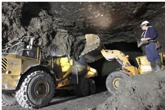
An employee of The Doe Run Company, which owns Sweetwater Mine, operates a front-end loader by remote control.

The calcite specimen is part of my study collection of minerals that exhibit fluorescence and phosphorescence. This collection mainly focuses on fluorescent minerals such as aragonite, calcite, strontianite, barite, fluorite and sphalerite that originate from various localities.