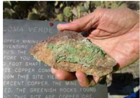
Copper ore found near the Loma Verde Mine, held in front of the sign near the mine.

The mining operation did not go on for long because the quality of the mineral obtained was 16% copper and a little gold per metric ton, which did not generate enough profit. The transport of the minerals from the high elevation of the smelting equipment and the salaries of the miners became insurmountable expenses. The mining ceased around 1901.