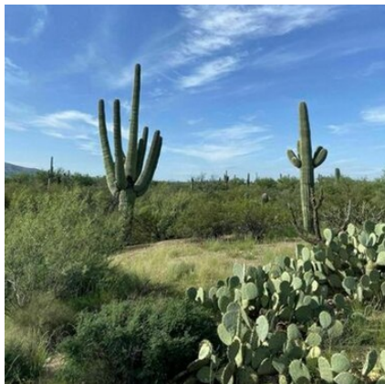
Photo of the Shantz-Vanover-Loma Verde-Cholla Cactus Forest Trail Loop