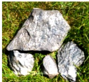
Specular Hematite.

I worried that the pile had been picked over, but it only seemed so because it was overcast. In the moments where the sun shone, I scrambled around adding rock after shiny rock to my bucket. The dump pile extended over a hill, which made it little difficult to get the collected rocks back to our vehicles, but we managed. I collected so many small to mid-sized pieces of hematite that the bucket split.