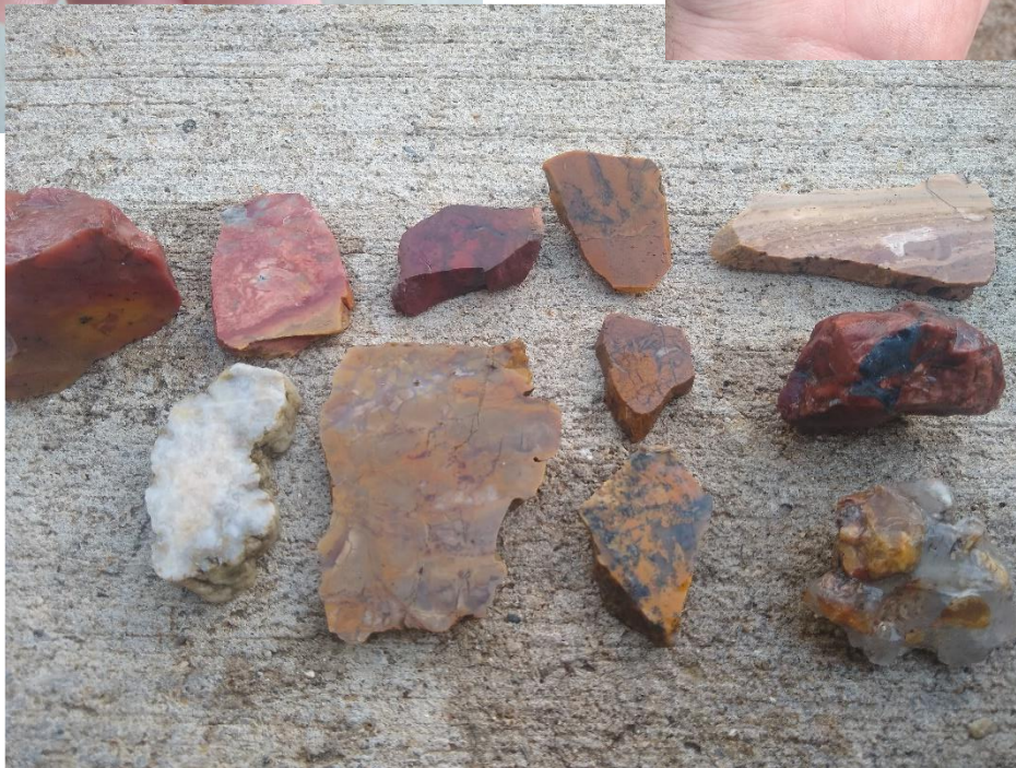
Petrified Wood !!