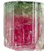
IT'S LITHIUM, OF COURSE!

Check out the Facebook page for Midwest Federation Newsletter and Wisconsin Geological Society Newsletter