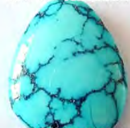
MY COLOR COMES FROM COPPER!