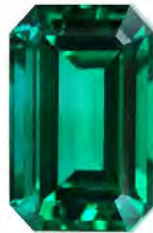
IT MAKES US GREEN!