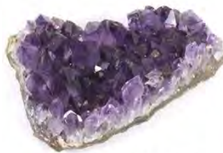
I'M PURPLE 'CAUSE THERE'S IRON IN ME!