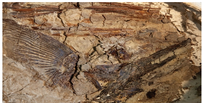
The Day the Dinosaurs Died

From the New Yorker https://tinyurl.com/y3jomlj5